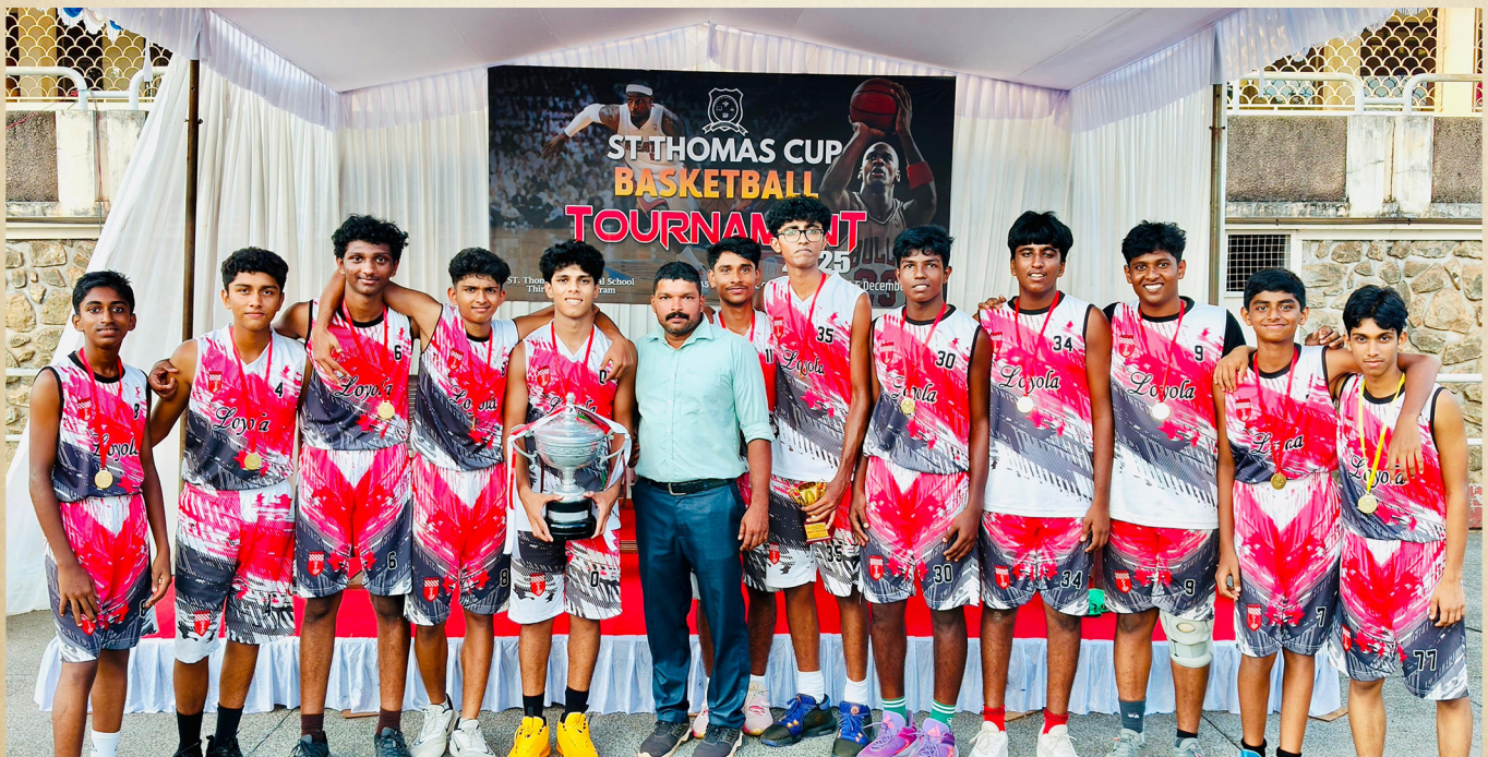
TEAM LOYOLA ST THOMAS CUP BASKETBALL TOURNAMENT