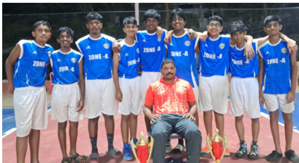
Loyola Boys in CISCE Zone A Basketball Teams, the Regional Champions Under 14 and Under 17 categories and the semi-finalist in Under 19 category