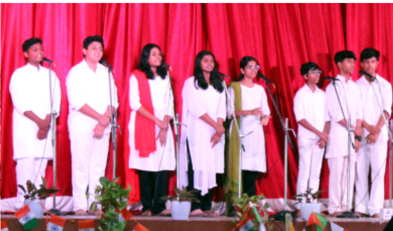
Prayer by the School Choir