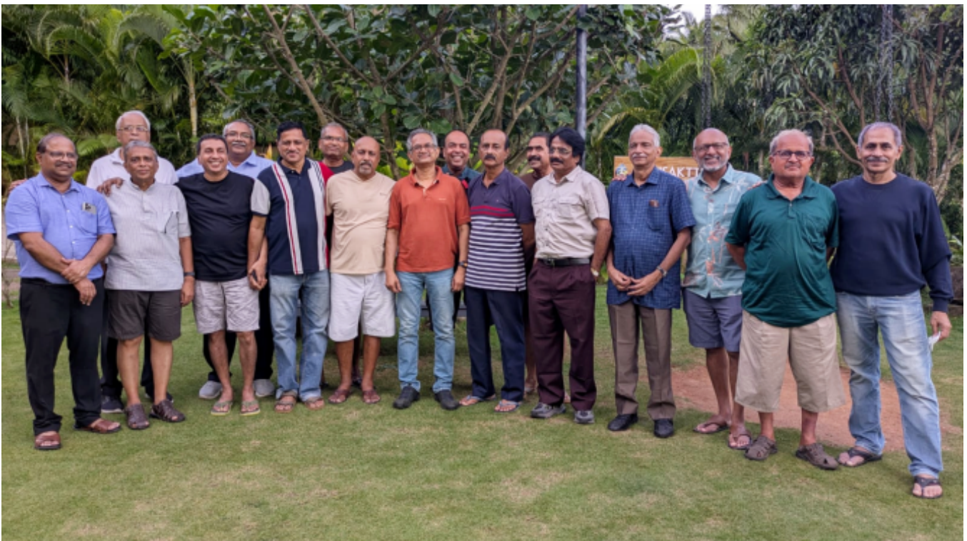
BOSS in their elements