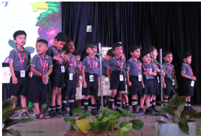
Fruit Salad Song by LKG