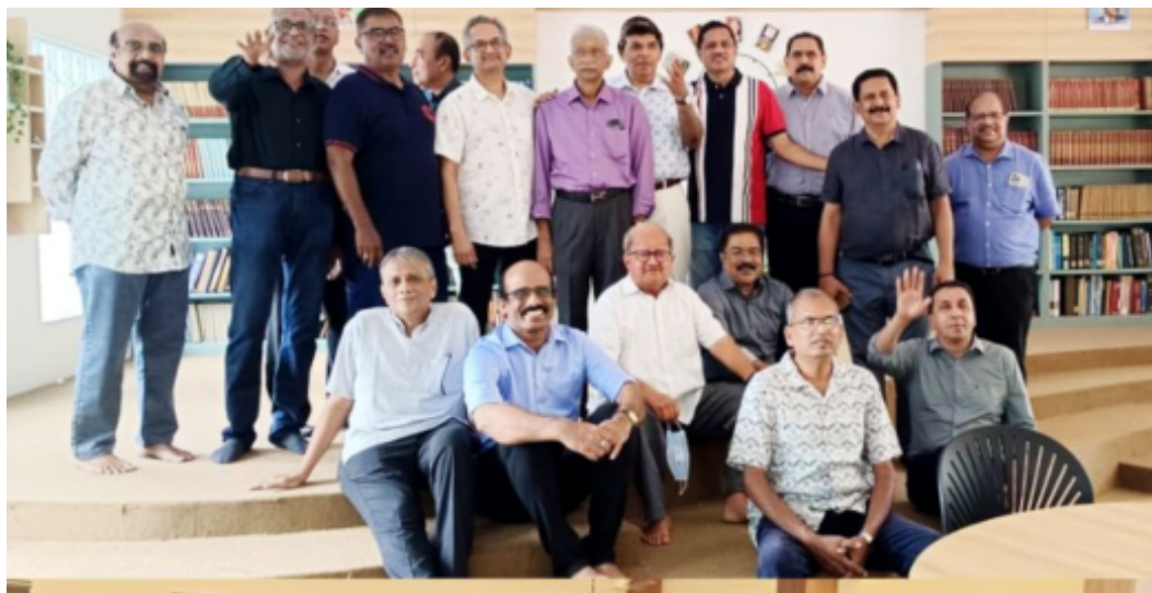
At the newly-renovated library