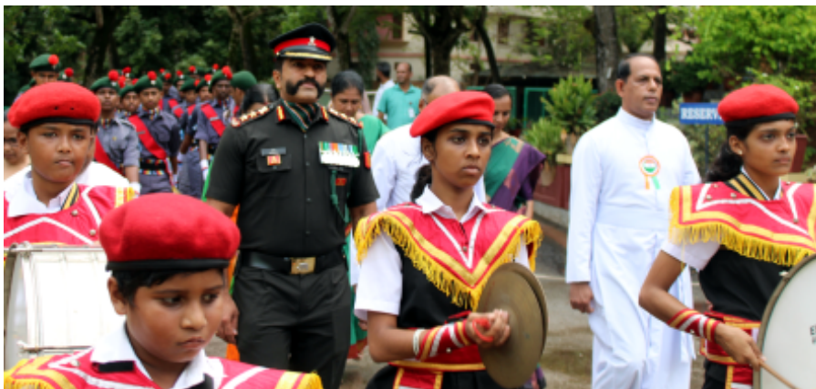
Salute to the Father of the Nation