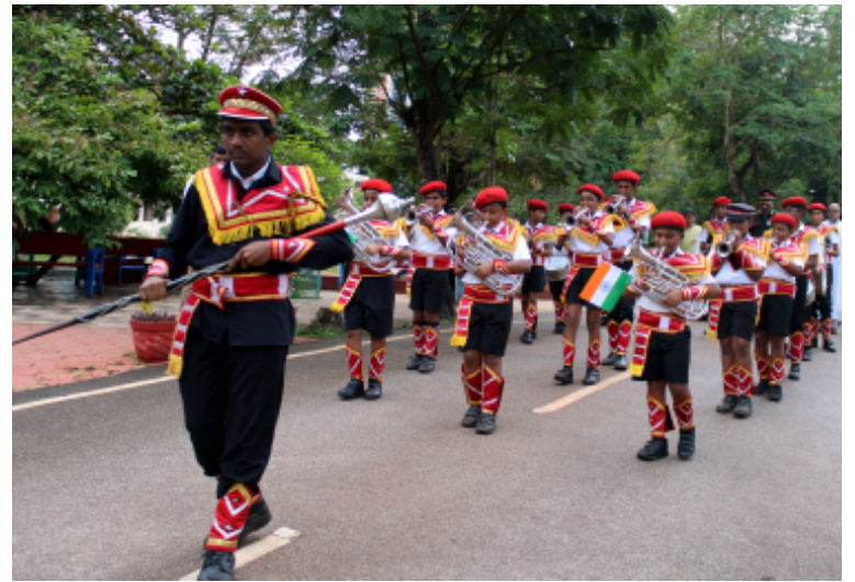
Ushering the Chief Guest to the Indoor Stadium