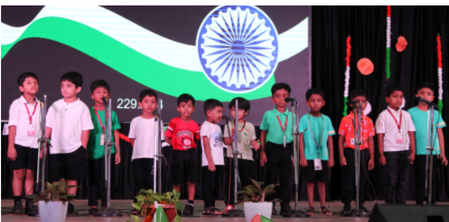
Patriotic Song by LKG & UKG