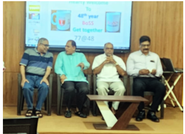
All set for the formal meeting