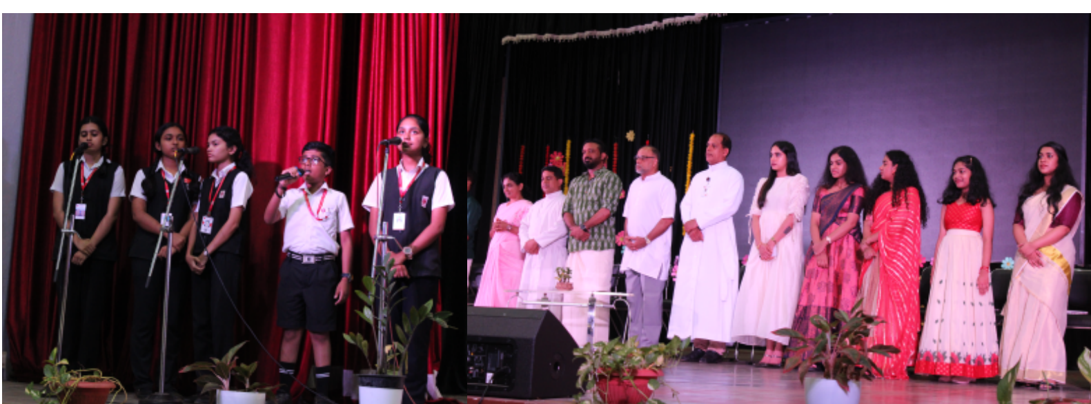
Prayer by School Choir