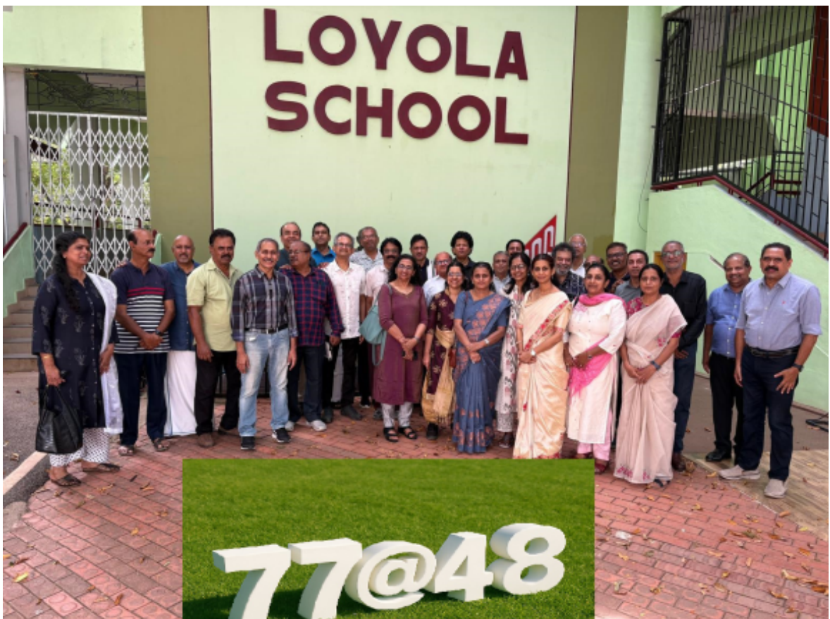
In front of Loyola ISC Facade