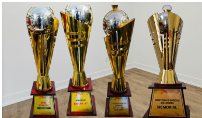
Facets of the new BEST ATHLETE TROPHY donated by BOSS (Boys of Seventy-Seven)