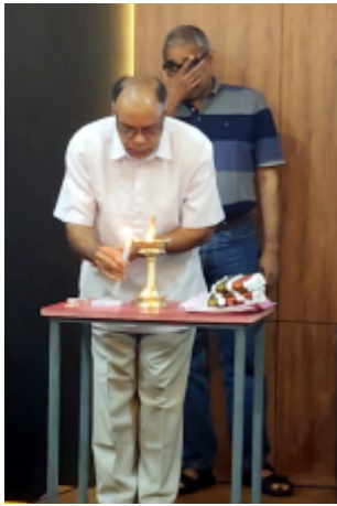
Lighting the lamp