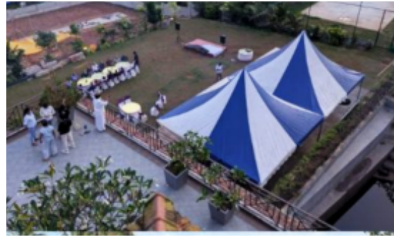
Spouses at Loyola