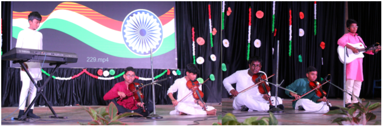
Musical Tribute to Independent India by Classes VIII & IX