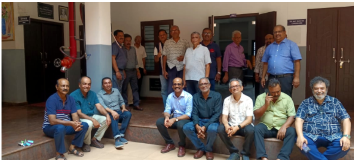
At the Diamond Jubilee Building, in front of the class sponsored by BOSS