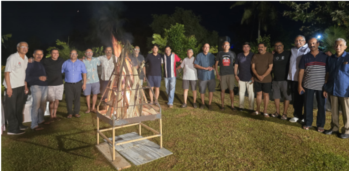
BOSS in front of the campfire at Aadishakti Resort, Kovalam