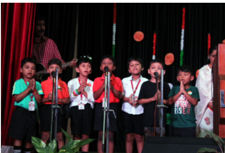
Prayer Song: UKG