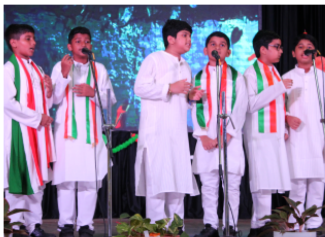
Patriotic Song: Classes IV & V