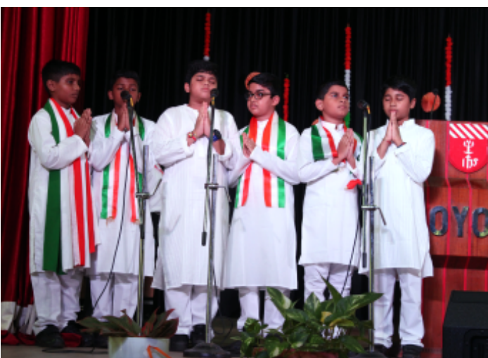
Prayer Song: School Choir