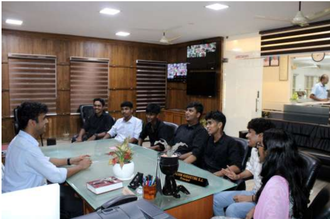
Conclave of the ad-hoc council for interim evaluation of the day's proceedings before the scene of action shifts from the indoor stadium to the cricket ground