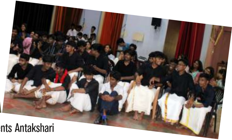
Staff vs Students Antakshari