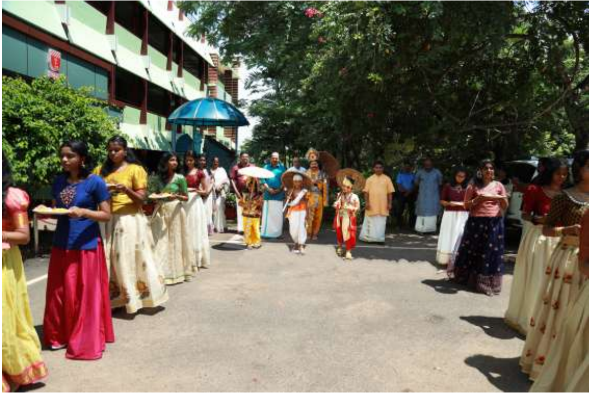
Procession to the indoor stadium for the formal function