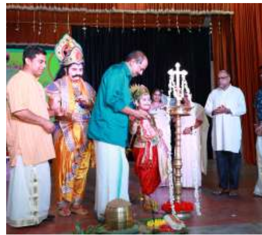
Shri G. R. Anil, Minister for Food and Civil Supplies, delivering his Onam message and lighting the floor lamp