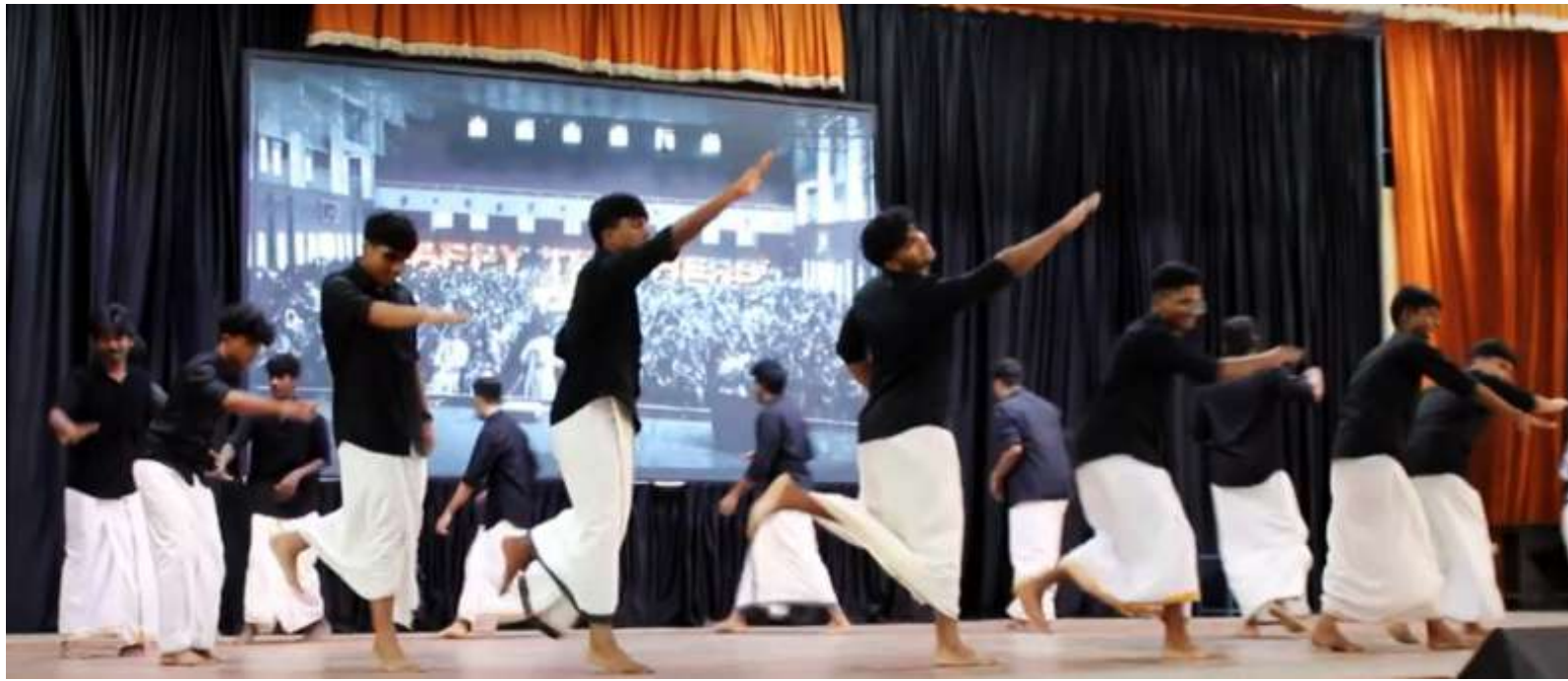
Thiruvathira Challenge by the Boys