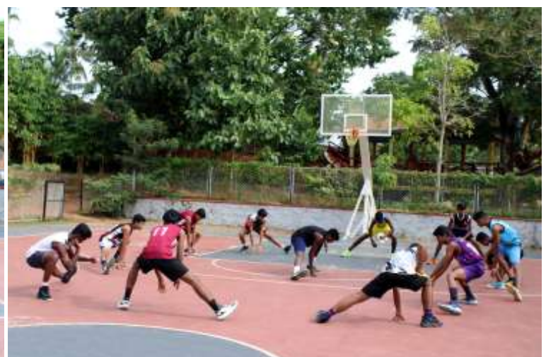
CISCE Basketball Kerala Regional Camp from 6 to 8 September 2024, at Loyola School