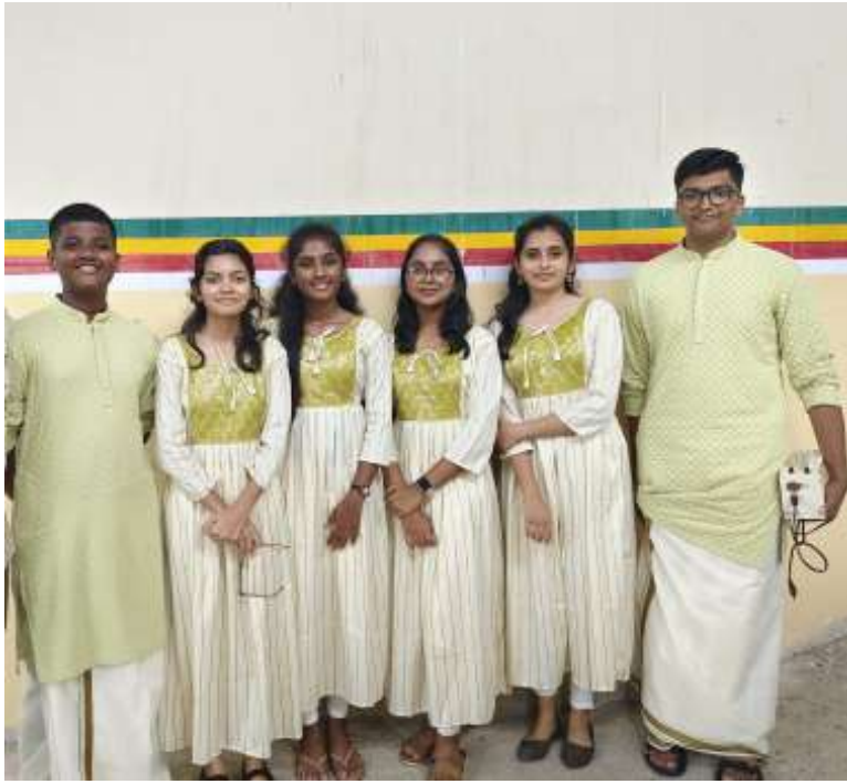
Patriotic Song and Group Song