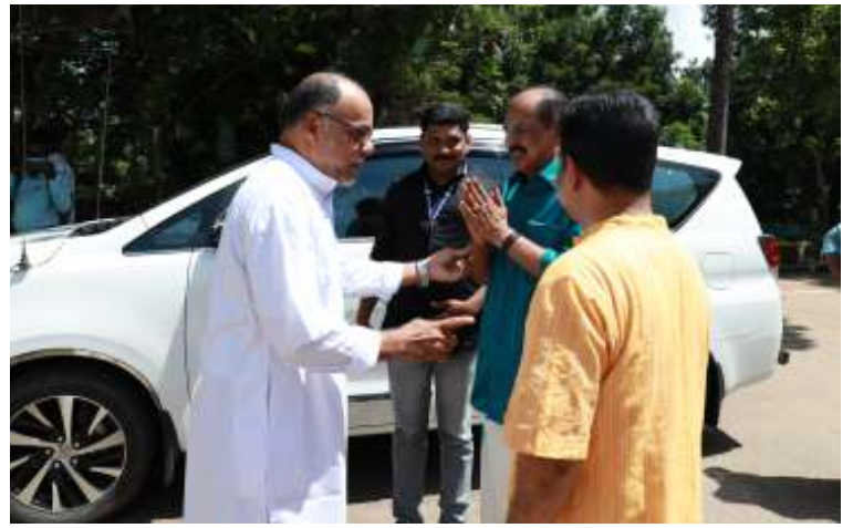
Reception of the Chief Guest