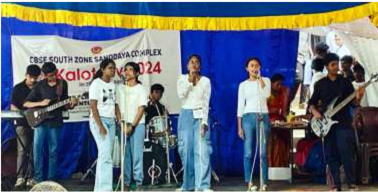
Western Music Concert