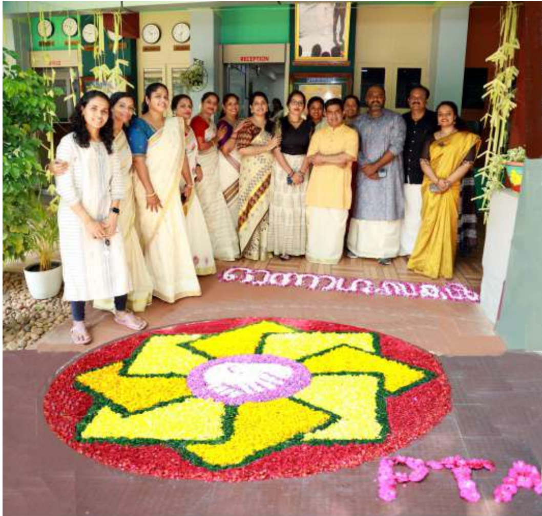
Waiting for the Chief Guest