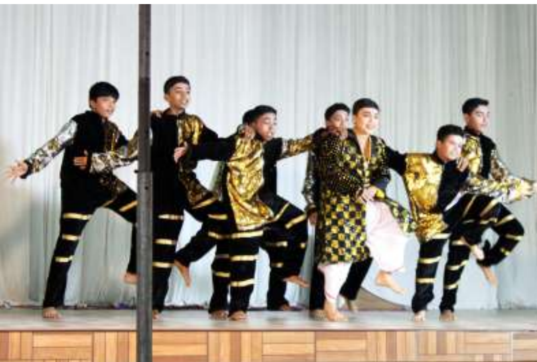
Third in Category 4 Theme Dance