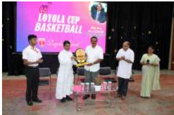
A Memento to the Chief Guest