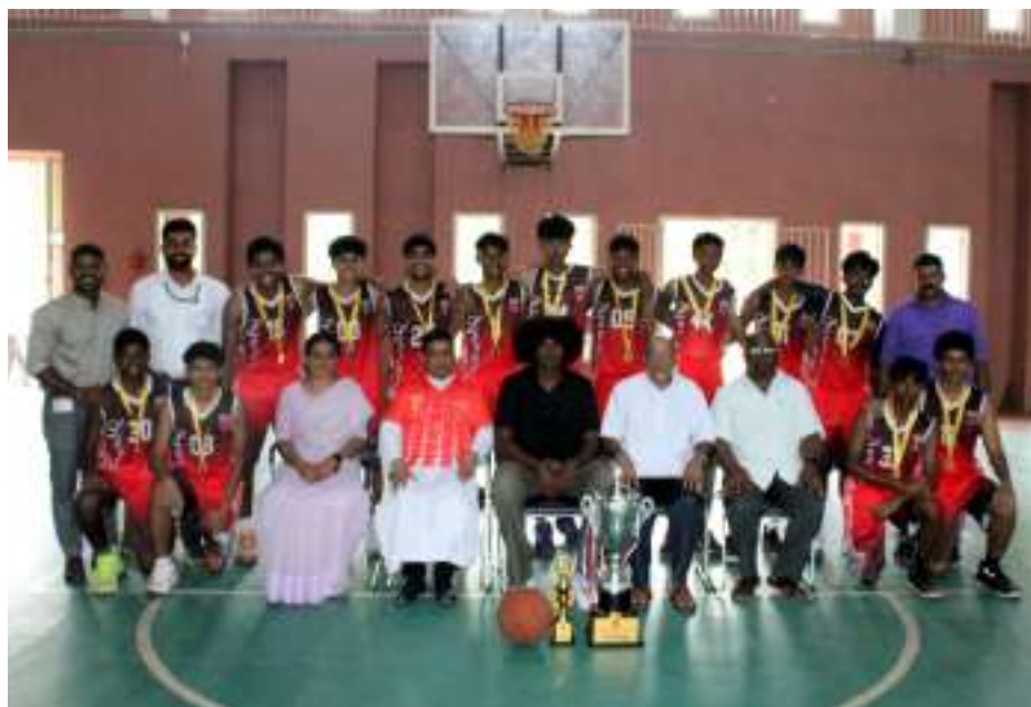
The Winners: Loyola School