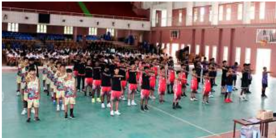
Pledge by the hoopsters