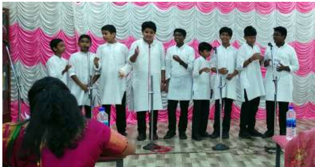
Third in Category 4 Group Song in Malayalam