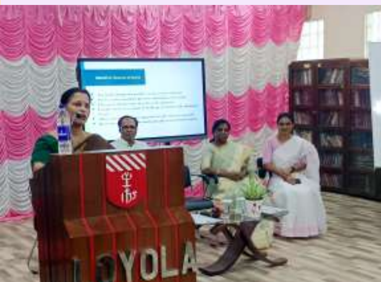
The post-lunch session in progress

beneficial, fostering collaborative learning and critical thinking.