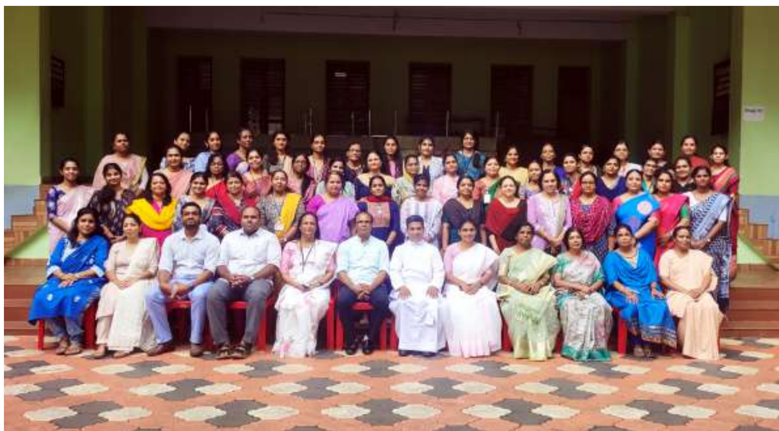
The participants along with the resource persons and the Principals