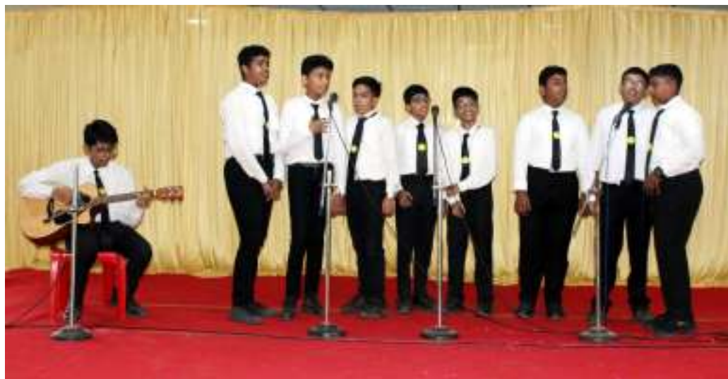
Second in Cat 4 English Group Song