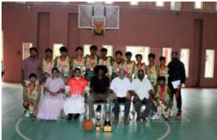
The Runners-Up: L'Ecole Chempaka Silver Rocks