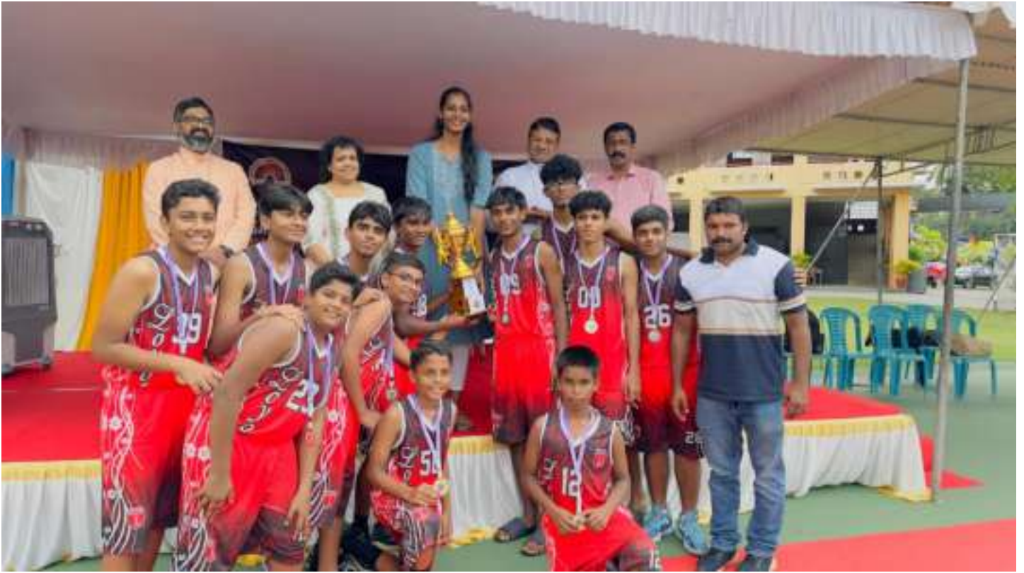
First in South Zone Sahodaya Complex Interschool Basketball Tournament 2024