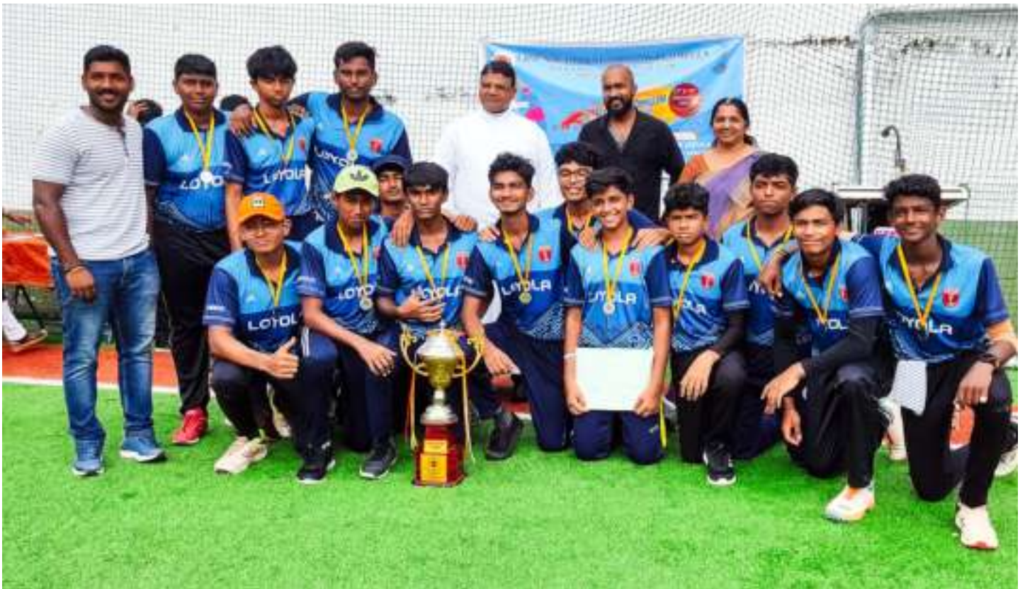
Second in South Zone Sahodaya Complex Interschool Cricket Tournament 2024