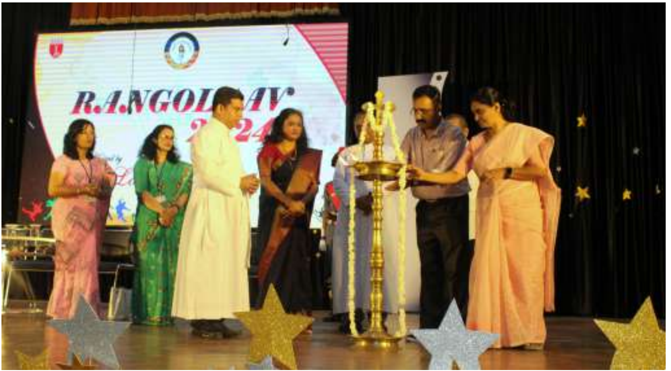
Lighting the floor lamp