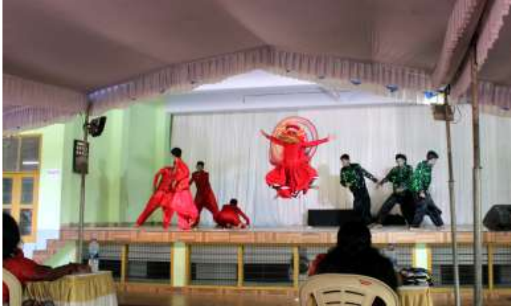
Third in Category 5 Theme Dance