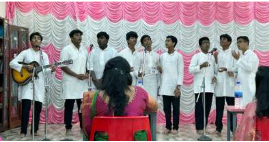
Third in Category 5 Group Song in Malayalam