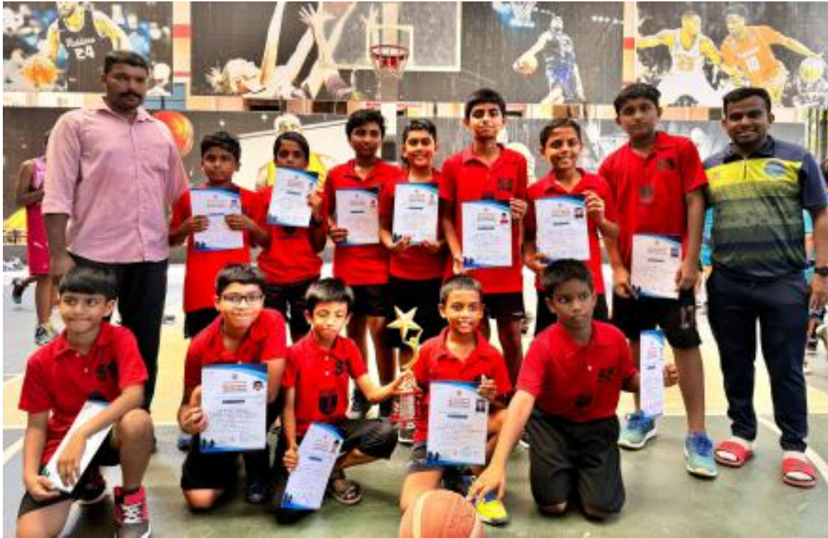
Loyola Team, Winners in Trivandrum District Basketball Championship (U 11)