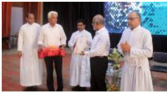
Release of four volumes of LENS