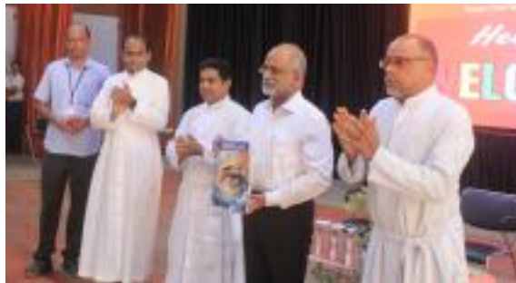
Release of teachers' magazine INSIGHT