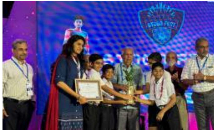
Receiving the Child Online Protection Award

Now I look forward to my next exhibition.