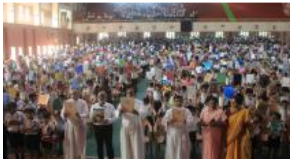
Released magazines held up in pride