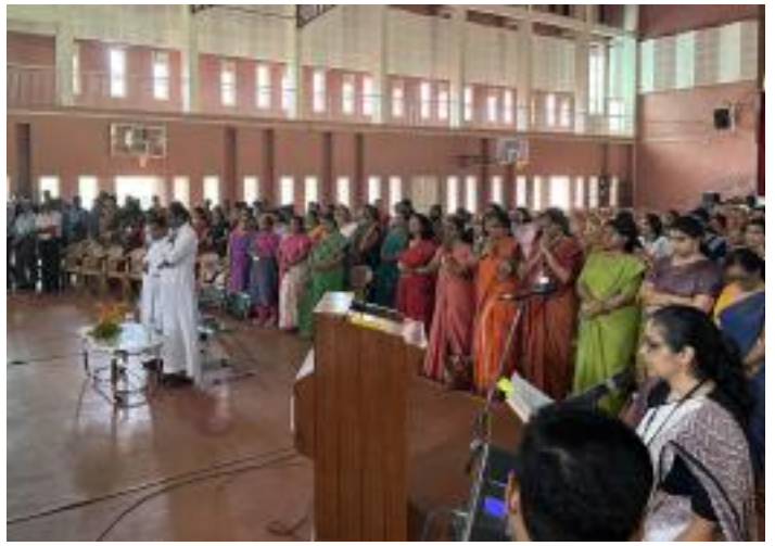
Solemn beginning to the Candlelight ceremony